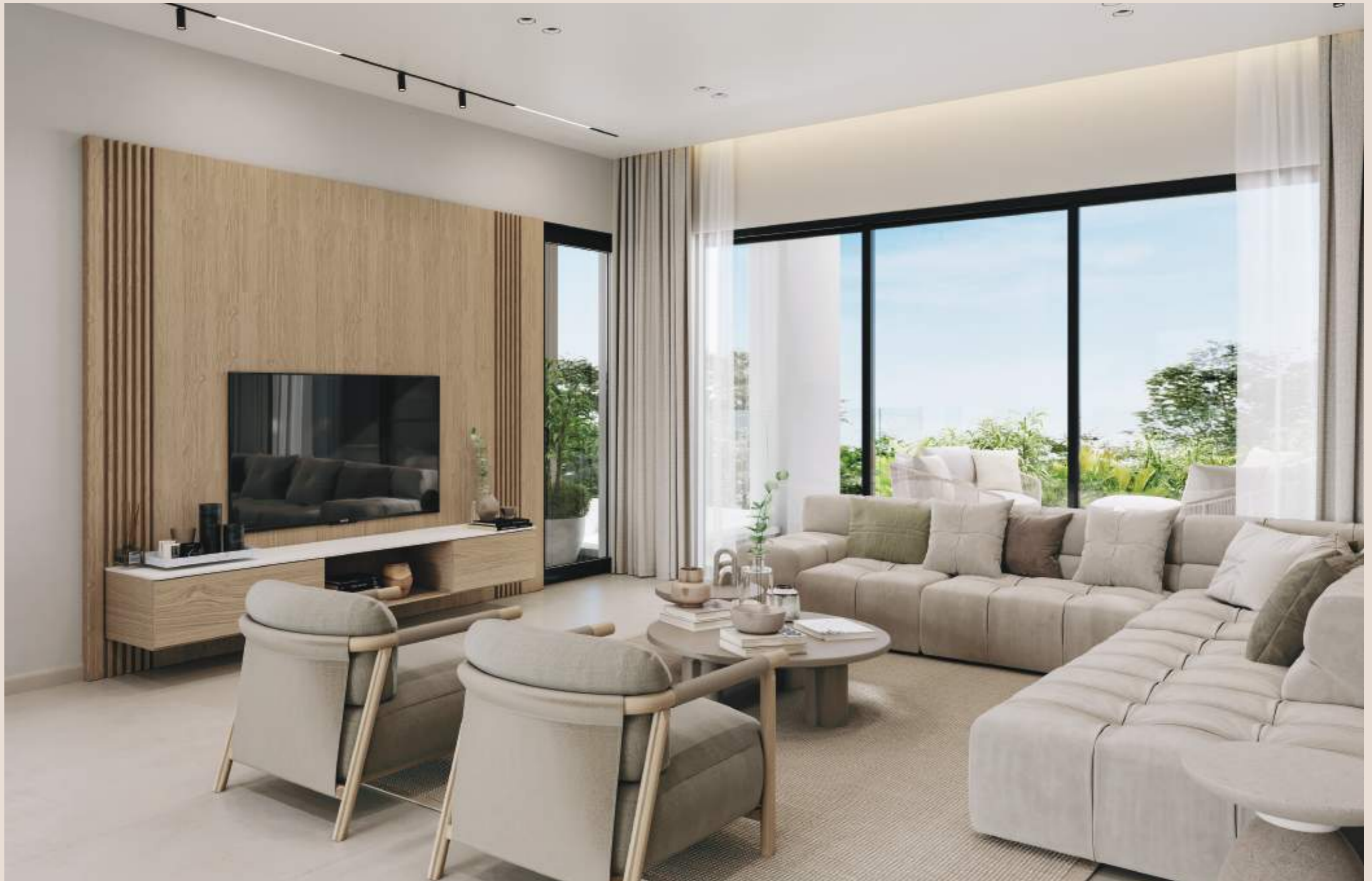
All images used are for illustrative purposes only, final outcome may differ from image shown.