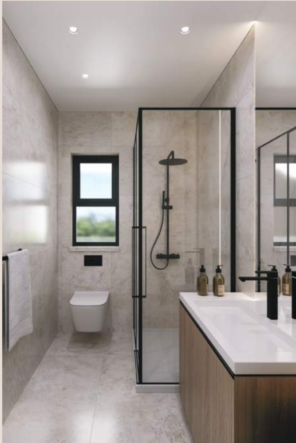
All images used are for illustrative purposes only, final outcome may differ from image shown.