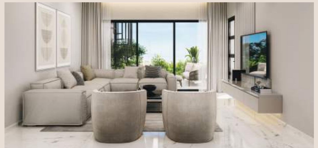
All images used are for illustrative purposes only, final outcome may differ from image shown.