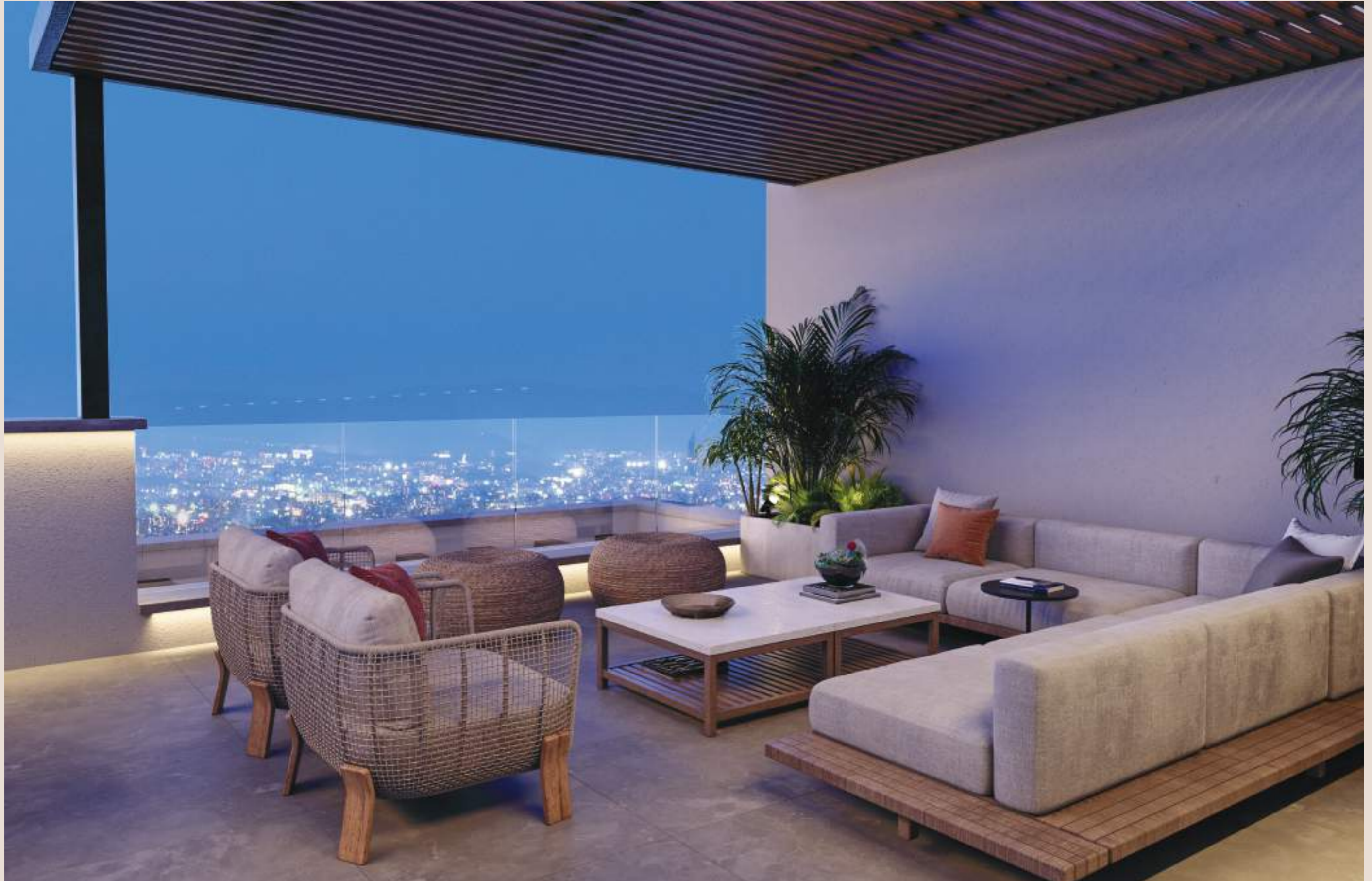
All images used are for illustrative purposes only, final outcome may differ from image shown.